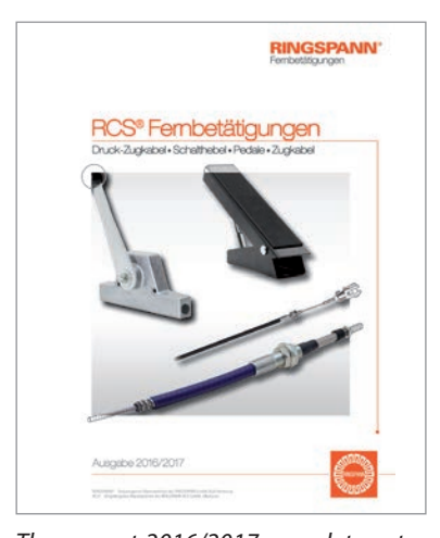
The current 2016/2017 complete catalogue of RINGSPANN RCS provides detailed information on the many different executions and delivery forms of the remote control systems as well as the large range of specially-adapted accessories